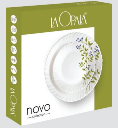
QUARTER PLATE SET 6 PCS