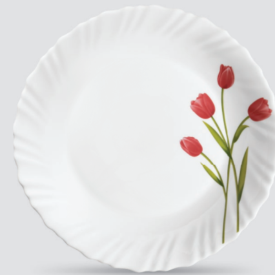
ROUND RICE PLATE 280 mm