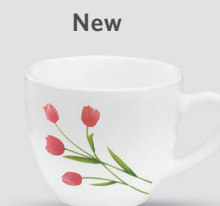
CUP LILY 150 ml