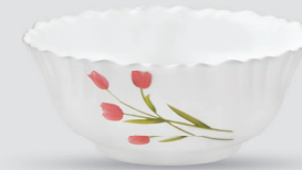
SOUP BOWL 115 mm • 270 ml