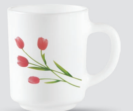
COFFEE MUG GRACE (M) 250 ml