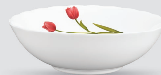
MULTIUTILITY BOWL 155 mm • 575 ml