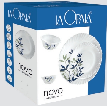
DINNER SET 20 PCS