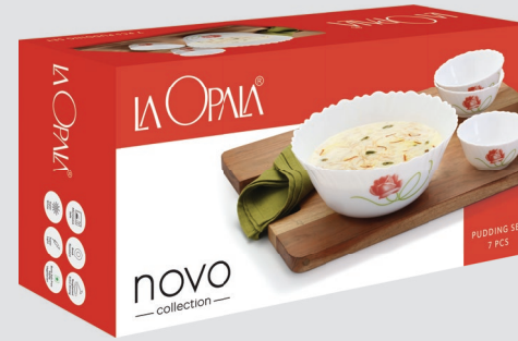
PUDDING SET 7 PCS