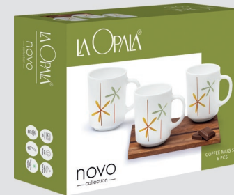
COFFEE MUG SET GRACE (M) 6 PCS