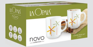
COFFEE MUG SET GRACE (M) 2 PCS