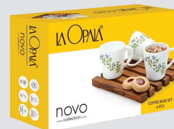
COFFEE MUG SET CLEO 6 PCS