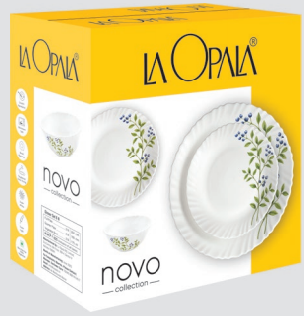
DINNER SET 6 PCS