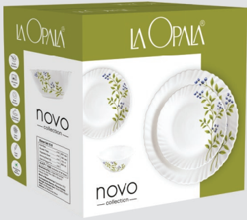
DINNER SET 15 PCS