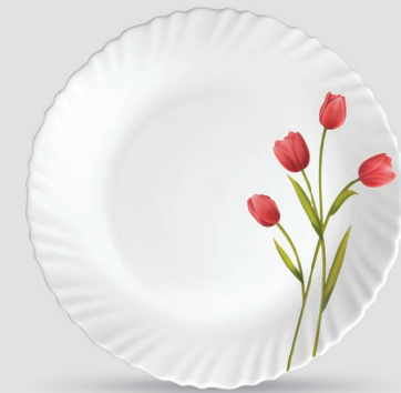
FULL PLATE 250 mm