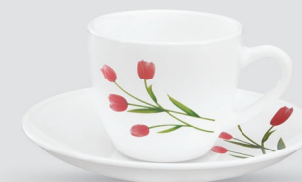
CUP & SAUCER LILY 150 ml