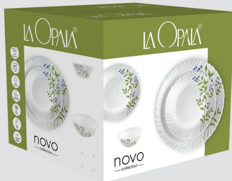
DINNER SET 46 PCS