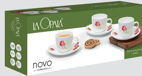
CUP & SAUCER SET LILY 12 PCS