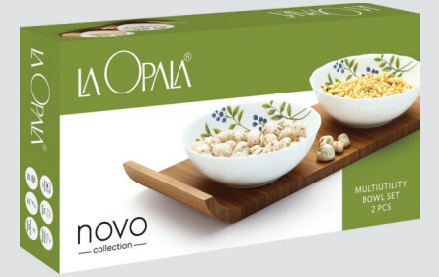
MULTIUTILITY BOWL SET 2 PCS