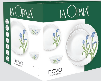
DINNER SET 29/35 PCS