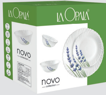
DINNER SET 12 PCS