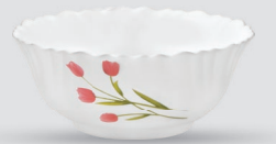
VEGETABLE BOWL 100 mm • 175 ml